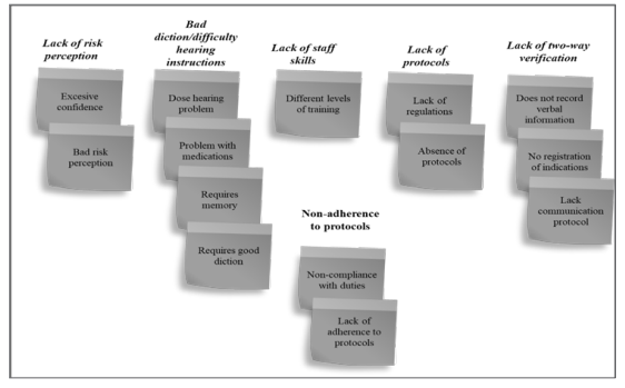
Figure 3: First convergence stage result - focus group 2

required due to the country's distinct characteristics and geography that mean the results of studies conducted elsewhere are not necessarily comparable with those of the local reality. Furthermore, the prioritization of the most important clinical quality and safety problems also differs from country to country. This is demonstrated by a study paralleling the present one conducted in Spain, where the first three risk priorities were improper hand hygiene of health professionals, ineffective interprofessional communication and medication errors occurring during patient care transitions.<sup>(21)</sup>